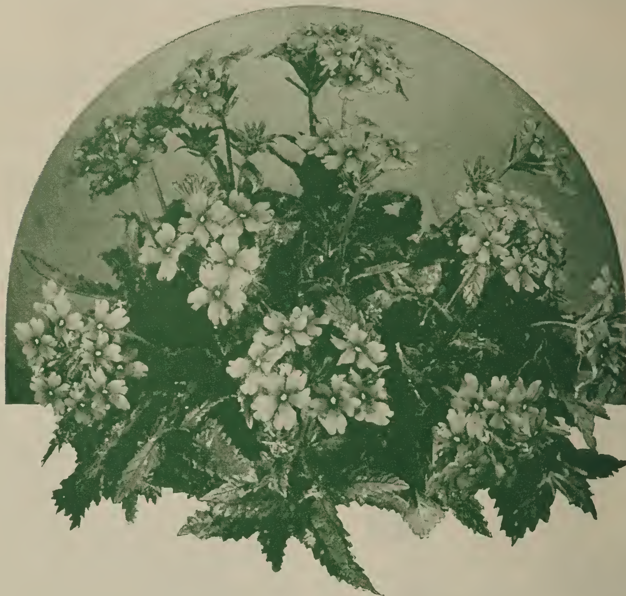
Verbena Hybrid Compacta Erecta Fireball